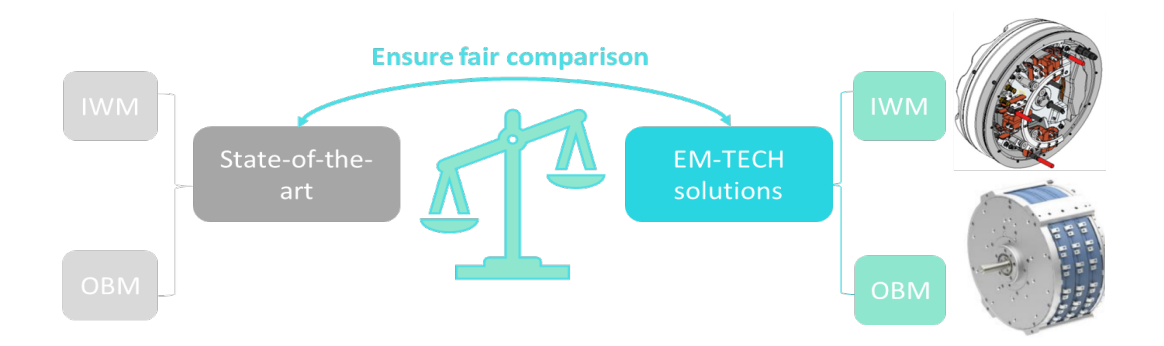
Figure 1. LCA/LCC approach

Two baselines are defined for the in-wheel motor and the on-board motor respectively to verify the final project enhancements by applying LCA/LCC methodologies. Various waste legislations are reviewed to determine the end-of-life scenario of the baselines and identify eco-design strategies to improve recyclability for both e-traction machines. Special attention is drawn to the Directive on End-of-Life Vehicles 2000/53/EC, which appears to be obsolete for not considering the features of e-vehicles and focusing on internal combustion engine vehicles.